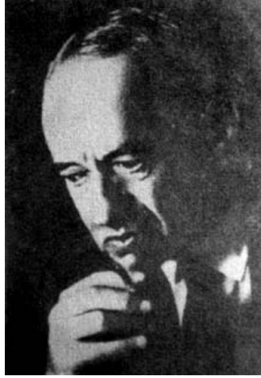
Alfred Tarski (1902 Warsaw -1983 Berkeley, USA)

EXERCISE 3.15 (**) (E) Suppose \langle M, E \rangle is a model of ZF. Show that there is a \langle N, E' \rangle EM with \langle N, E' \rangle a model of ZF.