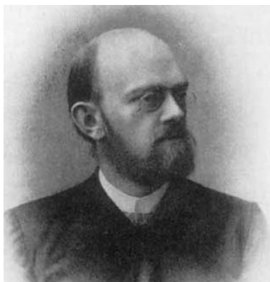
Hilbert in 1900