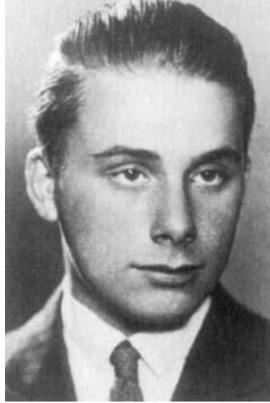
Andrzej Mostowski 1913-1975

EXERCISE 2.33 Check that HF is closed under all the assumptions of Lemmata 1.24 and 1.25 (except 1.24 (ii)) and even the power set operation. Hence (\text{ZFC} - \text{Ax} \cdot \text{Inf})^{\text{HF}} .