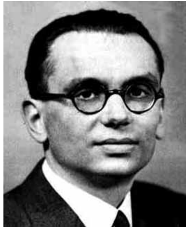
Kurt Gödel (1906 Brno - 1983 Princeton, USA)

In this chapter we define the constructible hierarchy due to Gödel, and prove its basic properties. Besides its original purpose used by Gödel to prove the relative consistency of AC and GCH to the other axioms of ZF, we can exploit properties of L to prove other theorems in algebra, analysis, and combinatorics. In set theory itself, properties of L can tell us a lot about V even if V \neq L .