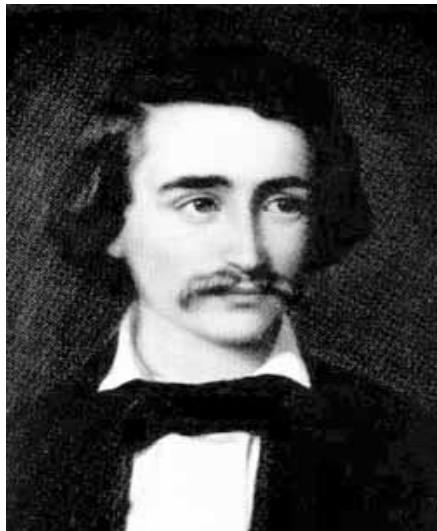
Figure 2.1: RICHARD DEDEKIND

We see how to extend the theory of sets to build up the natural numbers \mathbb{N} . It was R. DEDEKIND (1831-1916) who was the first to realise that notions such as “infinite number system” needed proper definitions, and that the claim that a function could be defined by mathematical induction or recursion required proof. This required him to investigate the notion of such infinite systems. About the same time G. PEANO (1858-1932) published a list of axioms (derived from Dedekind’s work) that the structure of the natural numbers should satisfy.