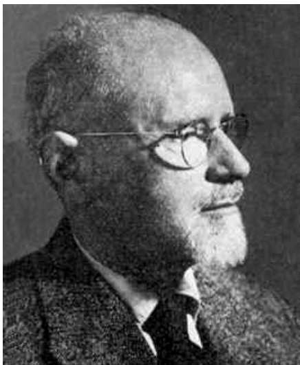
Figure 5.1: ABRAHAM FRAENKEL 1891-1965

was, and is, called Z for Zermelo) the set of finite numbered alephs in Example (ii) above, did not exist as a set (and nor did V_{\omega+\omega} ). Since the set of finite numbered alephs did not exist, \aleph_\omega did not exist.