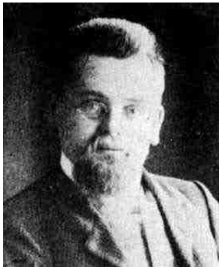
Figure 5.2: ERNST ZERMELO 1871-1953